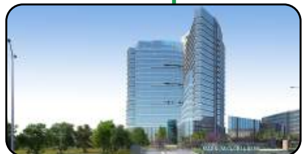
Magnum Sec-58, Gurgaon