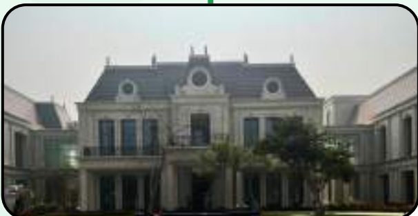
Juneja Farm House