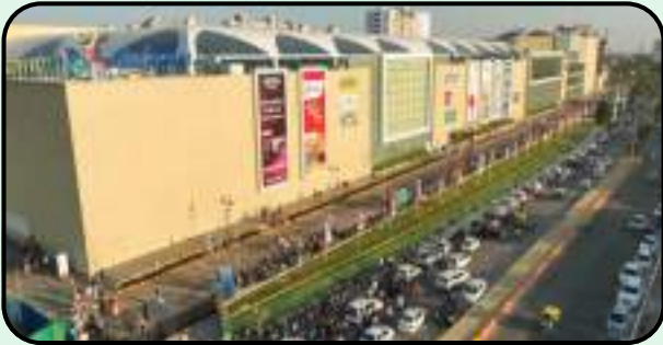
LULU Mall Lucknow