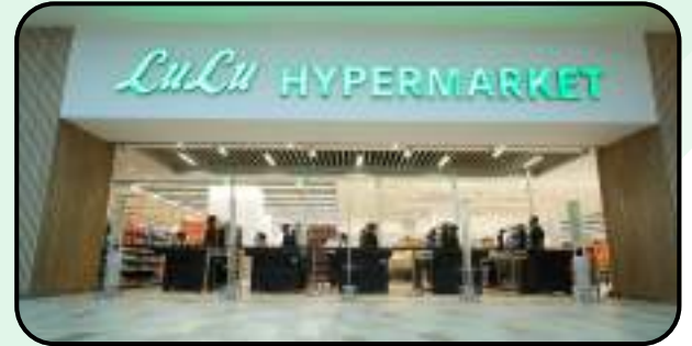
LULU- Hypermarket LKO