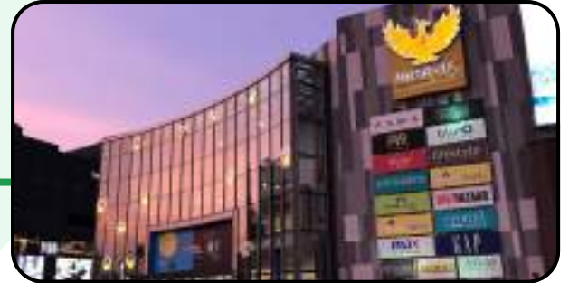
Phoenix United Mall LKO