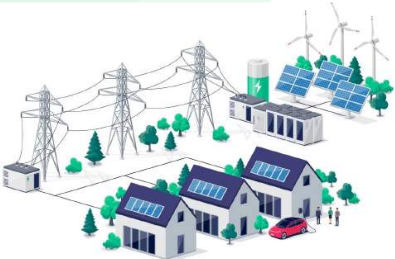
Solar Photovoltaic Plant