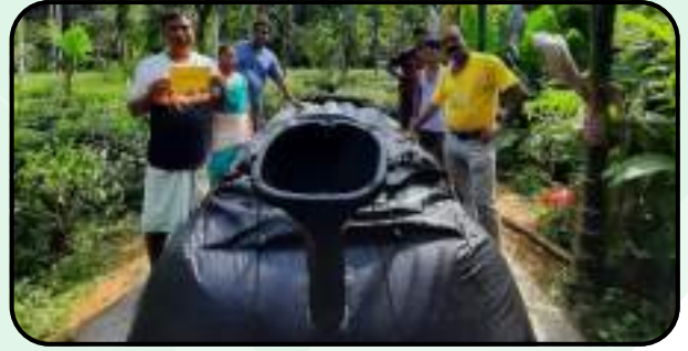
TATA Trust, Assam