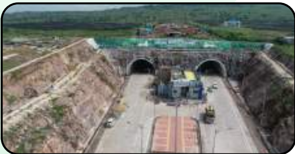
Rewa Sidhi Tunnel