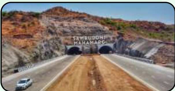
Samruddhi Tunnel PKG-14