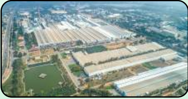
Saint Gobain- Bhiwadi