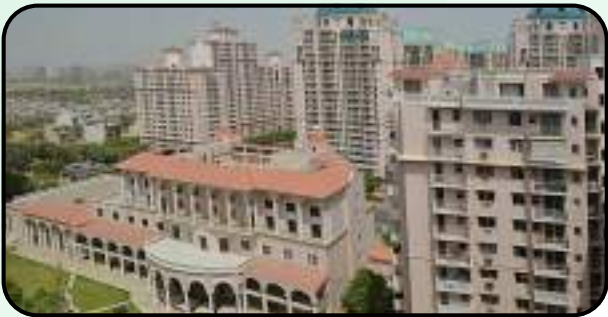
DLF Wellington Estate