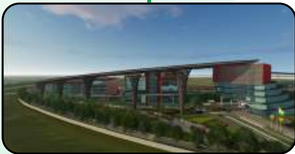
IOCL R&D Centre, FBD