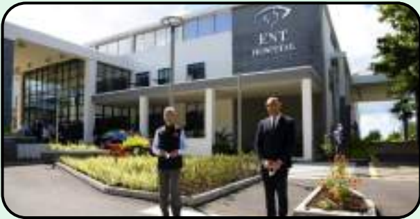
ENT Hospital Mauritius

We have worked with many industries, and this is your chance to see how our solutions have helped our clients achieve their goals.