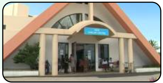
Cancer Hospital Mauritius