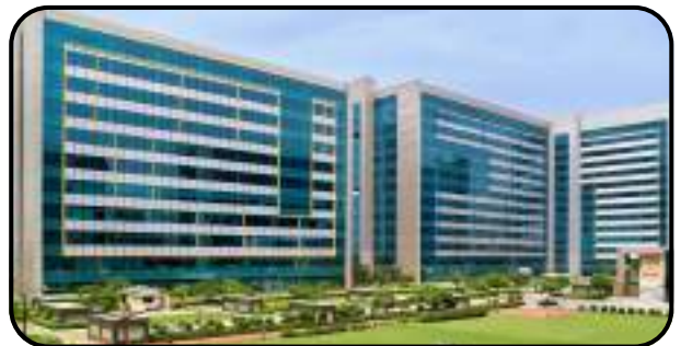
Candor Sector-48, Gurgaon