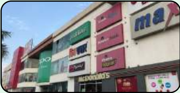
Phoenix United Mall Bareilly

Here, you'll find our active projects where we continue to provide cutting-edge solutions in energy, automation, and sustainability.