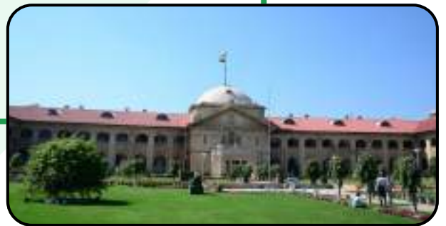
Allahabad High Court